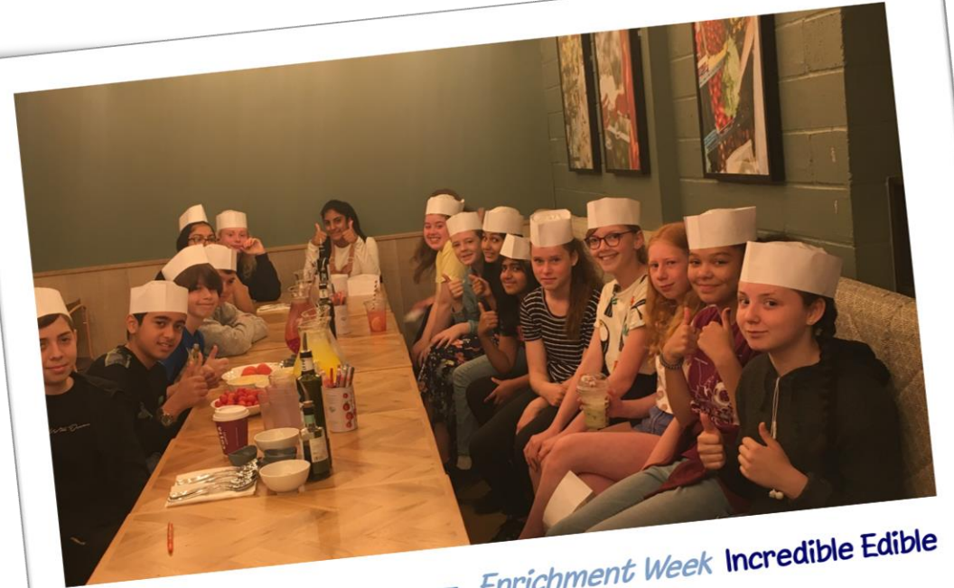
Enrichment Week Incredible Edible