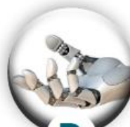
R is for Robotist