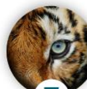
Z is for Zoologist

Join the conversation #whysciencematters