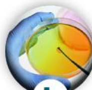
L is for Lab Technician