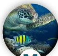
M is for Marine Biologist