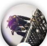
T is for Telecoms Technician