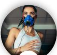
S is for Sports Scientist