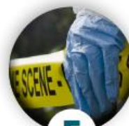
F is for Forensic Scientist