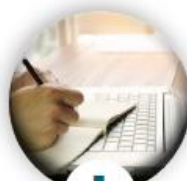
J is for Journalist