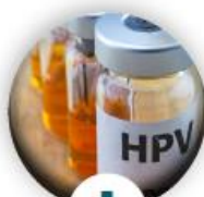
I is for Immunologist