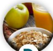
D is for Dietician