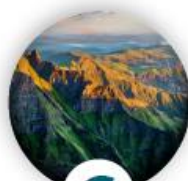
G is for Geoscientist