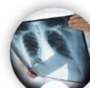
X is for X-ray Technician