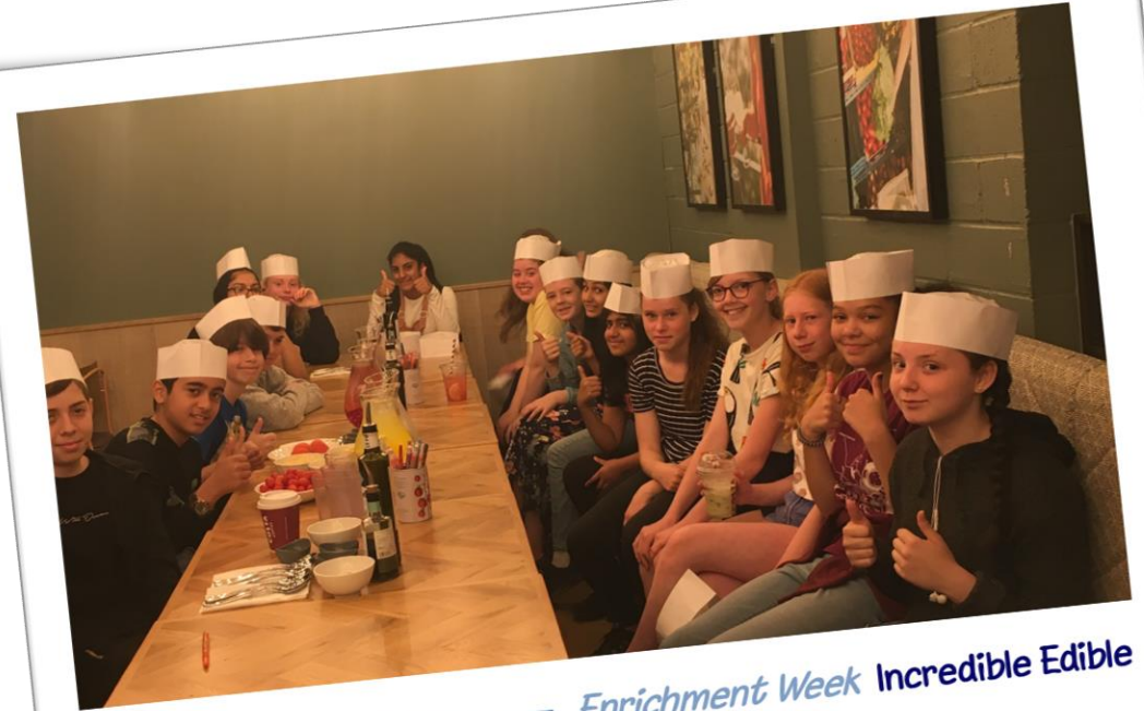
Enrichment Week Incredible Edible