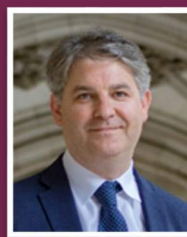
Philip Davies: Conservative Party

I think young people should be interested and get involved in politics as I did. Whilst the voting age is 18, there are many other ways those under that age can participate politically – school/student politics via political parties, through local or national campaigns. These days there are many ways to get your voice heard.